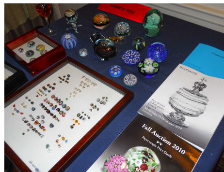
Show & Tell