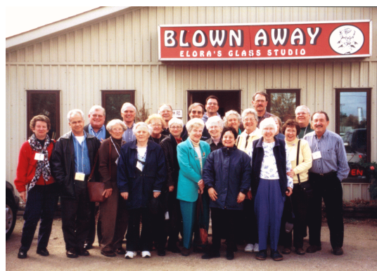
Elora: PCA Ontario Fall 2002 Coach Tour

The Convention Application will be ready on or about January 15, 2003. If you'd like a copy contact Emily Kak, the PCA Administrative Assistant at 336-869-2769. Or, PCA Inc., PMB 130, 274 Eastchester Drive, #117, High Point N.C. USA, 27262, or at www.paperweight.org