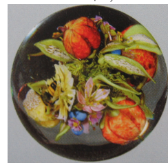
Paul J. Stankard

Single yellow rose with five buds on clear background. Signature cane and dated. 3.25" dia. Value $1,500