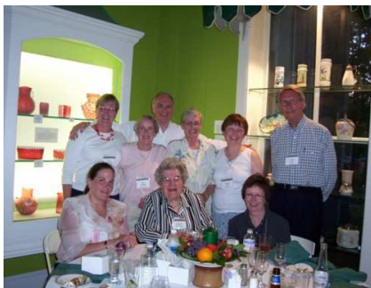
Canadian members, accompanied by their ‘honorary member’ visiting from the UK, celebrated a wonderful evening surrounded by the glass exhibits in the Museum of American Glass.

W heaton Village hosts the Museum of American Glass which was the venue for the closing event. Surrounded by paperweights, depression glass, Tiffany glass and other wonderful displays, the artists, dealers and collectors together enjoyed a dinner and evening of socializing.